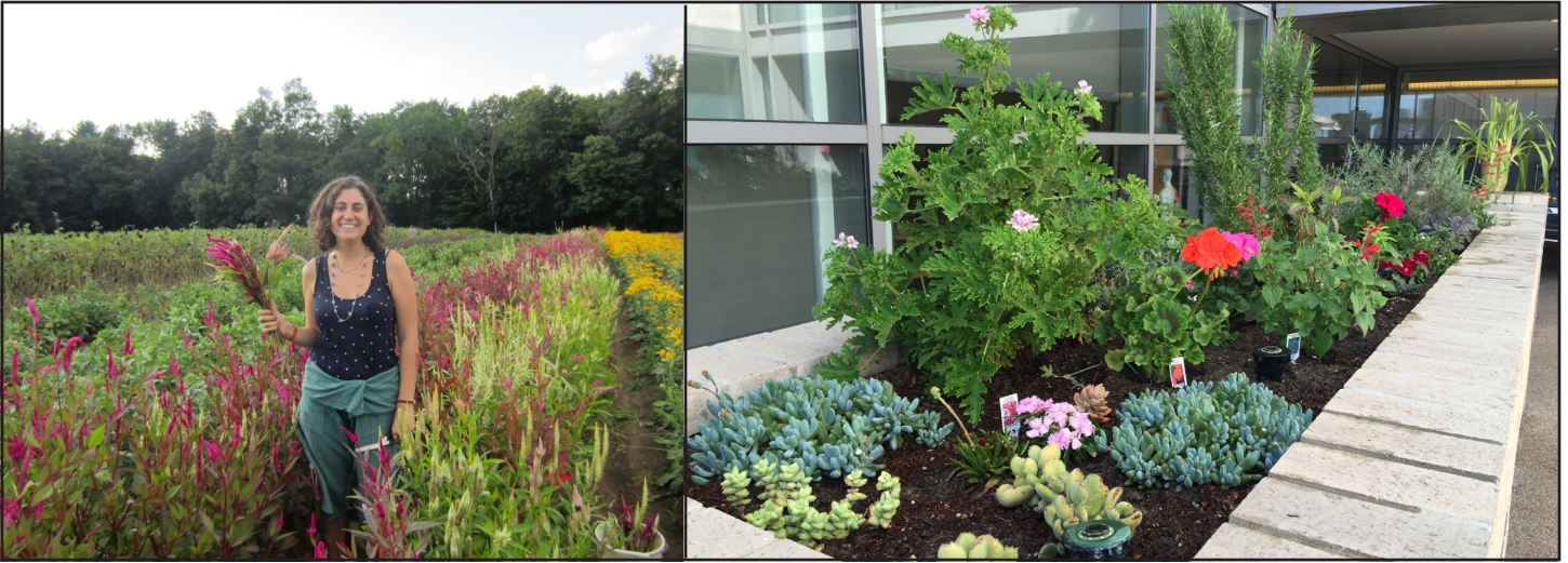
Left: The author enjoys time spent on a farm in Massachusetts near Smith College, where she completed her graduate work. Right: The therapeutic horticultural sensory garden at the UCLA Resnick Neuropsychiatric Hospital, the author's workplace.

currently underway is the first-of-its-kind sensory garden at the UCLA Resnick Neuropsychiatric Hospital where I work. Once weekly, adult patients are invited to interact with the garden to the best of their ability whether that means turning the soil, pruning the plants, smelling the herbs, watering, or simply watching other people complete these tasks. By patient self-report, there is an improvement in patients' mood and evidence that gardening has reduced the amount of physical and chemical restraints needed on the unit. We hope to be able to show that our integration of horticulture therapy into our regular milieu program has contributed to a significant reduction in patient heart rate and blood pressure, as well as to an overall positive experience in the inpatient unit.