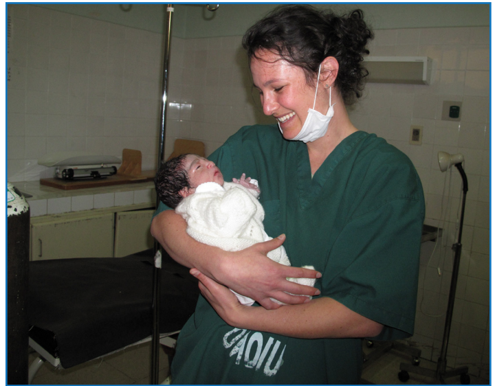
The author holding a newborn during her trip to Bolivia, where she volunteered for a pediatric health program.

After all, though the facility had been built to serve an